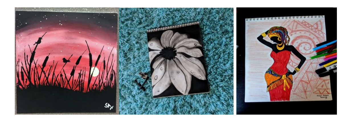
PAINTING By Saudamini Khare