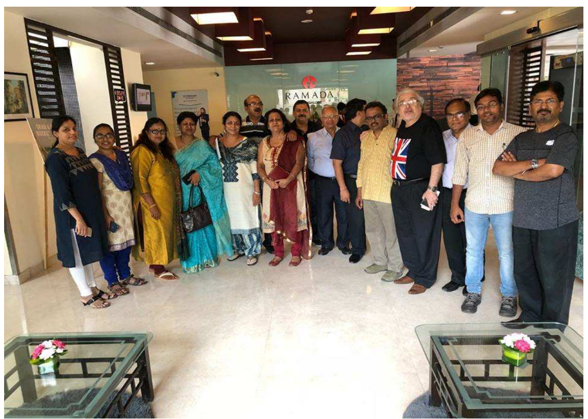
Held on 30^{th} June and 22^{nd} July 2018